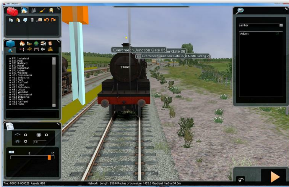
Original Tracks at Bath.